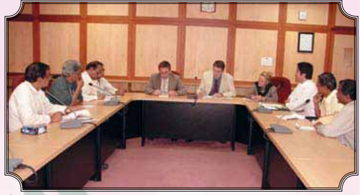
AERB and French Regulatory Body, ASN Delegates deliberating in a meeting after the AERB-ASN Seminar on Nuclear Reactor Safety

Technical presentations were made by the members of Russian delegation and the Indian team on the topics of regulatory and licensing process, aspects related to construction experience, severe accident analysis, experience on safety review of control