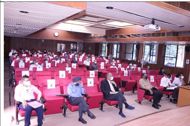
Delegates attending Theme Meeting from Auditorium at NB-A following COVID-19 protocol