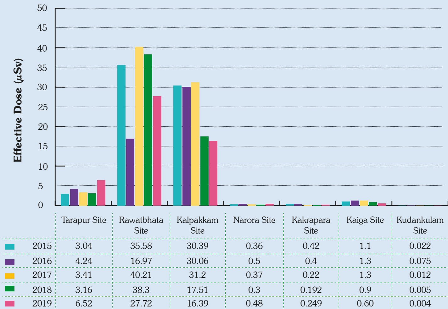
Fig 4.1 (a): Public Dose at 1.6 Km Distance ( Exclusion Boundary) for NPPs (AERB Prescribed Annual Limit is 1000 micro-Sievert( \mu Sv))

Note: Public dose at Rawatbhata and Kalpakkam sites are relatively higher as compared to other reactor sites, due to release of Ar-41 from RAPS-2 and MAPS (which are within the prescribed technical specification limits).