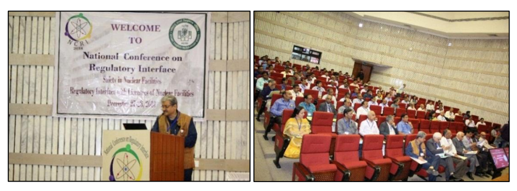
Some Glimpses of National Conference on Regulatory Interface (NCRI – 2018)