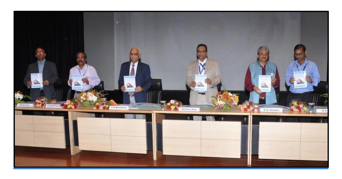
Release of 'Occupational Injury and Fire Statistics -2017' during the Meet