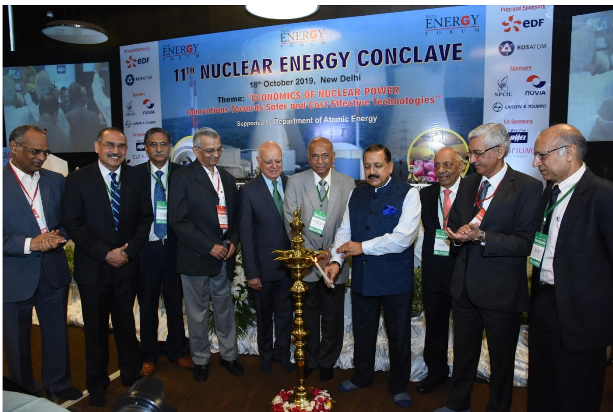
Dr. Jitendra Singh, MoS(I/C) for DoNER, MoS in Prime Minister's Office, DoPT, Dept. of Space and Atomic Energy inaugurating the Conclave on 18 th October, 2019