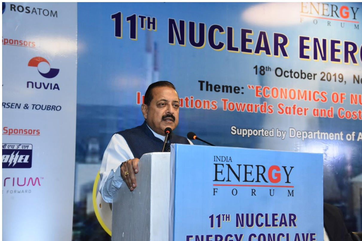
Dr. Jitendra Singh, MoS(I/C) for DoNER, MoS in Prime Minister's Office, DoPT, Dept. of Space and Atomic Energy addressing the Conclave

Chairman, AERB chaired the Session on "Use of nuclear energy in Healthcare and Municipal Waste Treatment". He briefed about the radiation applications for societal benefits in health care for therapy, diagnosis, Nuclear medicine, Industrial Applications and Research Applications. He explained numerous applications of radioisotopes in industrial applications such as radiation processing for food preservation, sterilization of medical products, municipal waste treatment, blood irradiation, industrial radiography for non-destructive examination (NDT), etc. During the session following three special presentations were made on radiation technologies and waste disposal. (1) Imaging using radioisotopes for Diagnostics; (2) Radioisotopes for Therapeutics and (3) Management of radioactive waste in health care and research sectors.