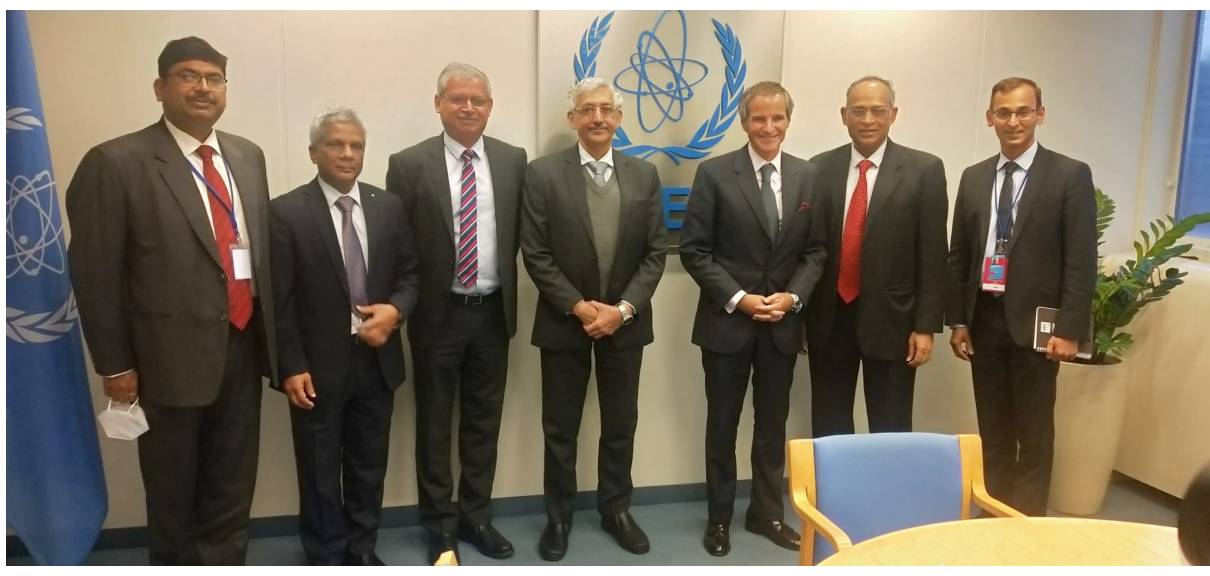
Indian delegation with Director General, IAEA