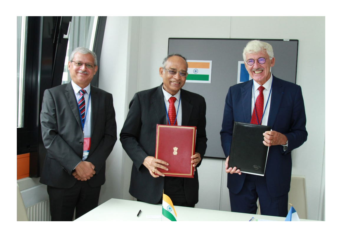
Page 2 of 5