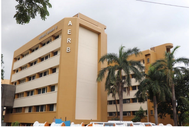
परमाणु ऊर्जा नियामक परिषद, मुंबई Atomic Energy Regulatory Board, Mumbai