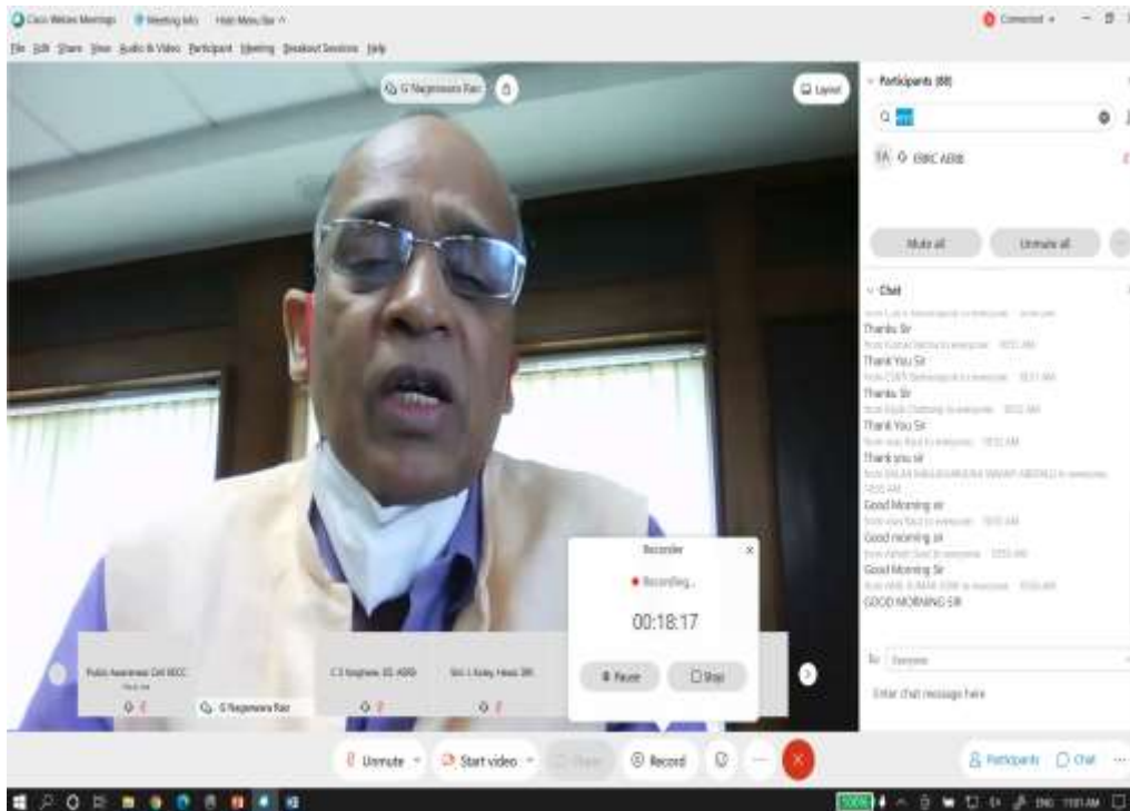
Chairman, AERB addressing the Participants