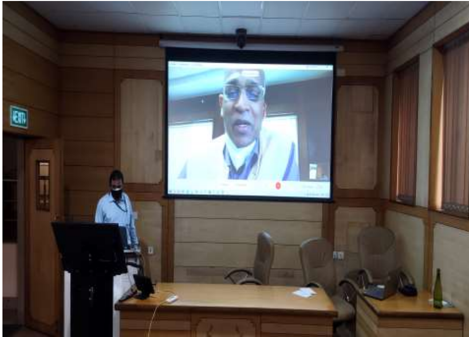
Virtual Awareness Programme Organised By ERRC, AERB

even requested AERB to organize such awareness programme periodically for the benefit of the radiation workers of the organization using nucleonic Gauges.