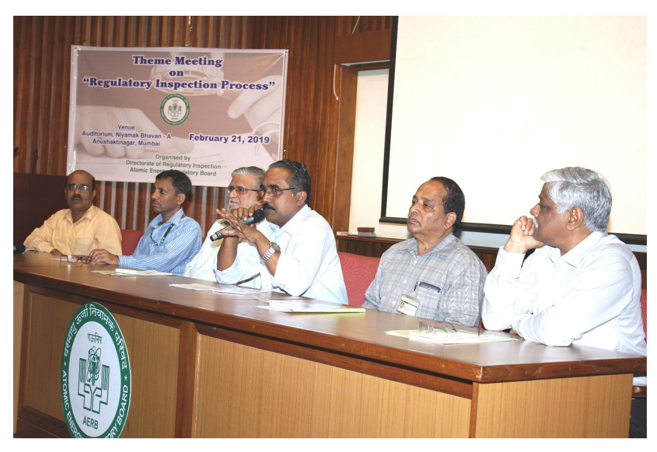
Panel discussions during the Theme Meeting